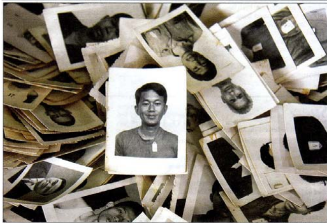
More than 1,000 passport-sized photos believed to show inmates of the Khmer Rouge-era Tuol Sleng detention and torture center were donated to the Documentation Center of Cambodia yesterday. The photographs could help identify more of the estimated 14,000 people who perished at the prison.