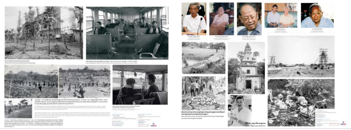
DC-Cam Quarterly Report: January-March, 2017

In response to the request from a head of monk at Wat Thmei (Pagoda) in Siem Reap Province and expanding the knowledge of the public about KR period, DC-Cam has installed two new outdoor panels in additional to its existing exhibitions on "the Forced Transfer" and "Phnom Penh 1975-1979". These two new panels display photographs of Khmer Rouge leaders, daily life during the Khmer Rouge Regime, and memorials that have been constructed after the Khmer Rouge Regime.