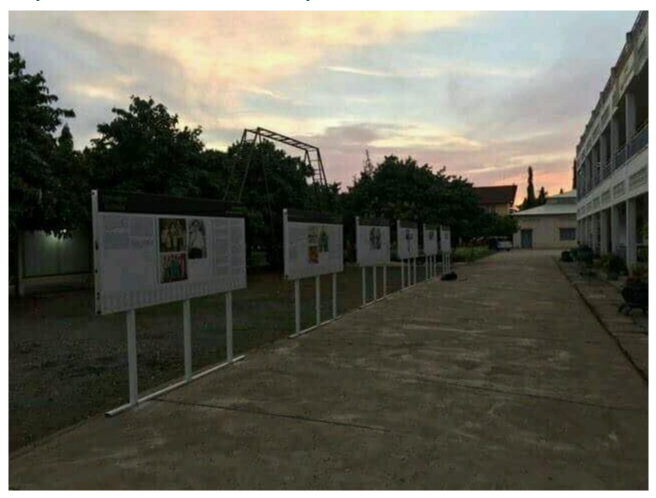
New installation of "Forced Transfer" exhibition at Battambang regional training center

DC-Cam has been conducting a follow-up to it's exhibitions in the various provinces, both to gauge the exhibitions' use as well as to identify issues or concerns with the exhibitions. DC-Cam members conducted follow-up phone calls to three (3) governmental provincial museums in Takeo, Svay Rieng, and Battambang provinces. Based on discussions with administrators in Takeo and Svay Reing, the assessment of the museum exhibitions was positive. The officials stated that they continue to take good care of the exhibitions. Of note, the exhibit in Battambang museum was relocated to the Battambang regional training center compound due to a restoration of the museum premises.