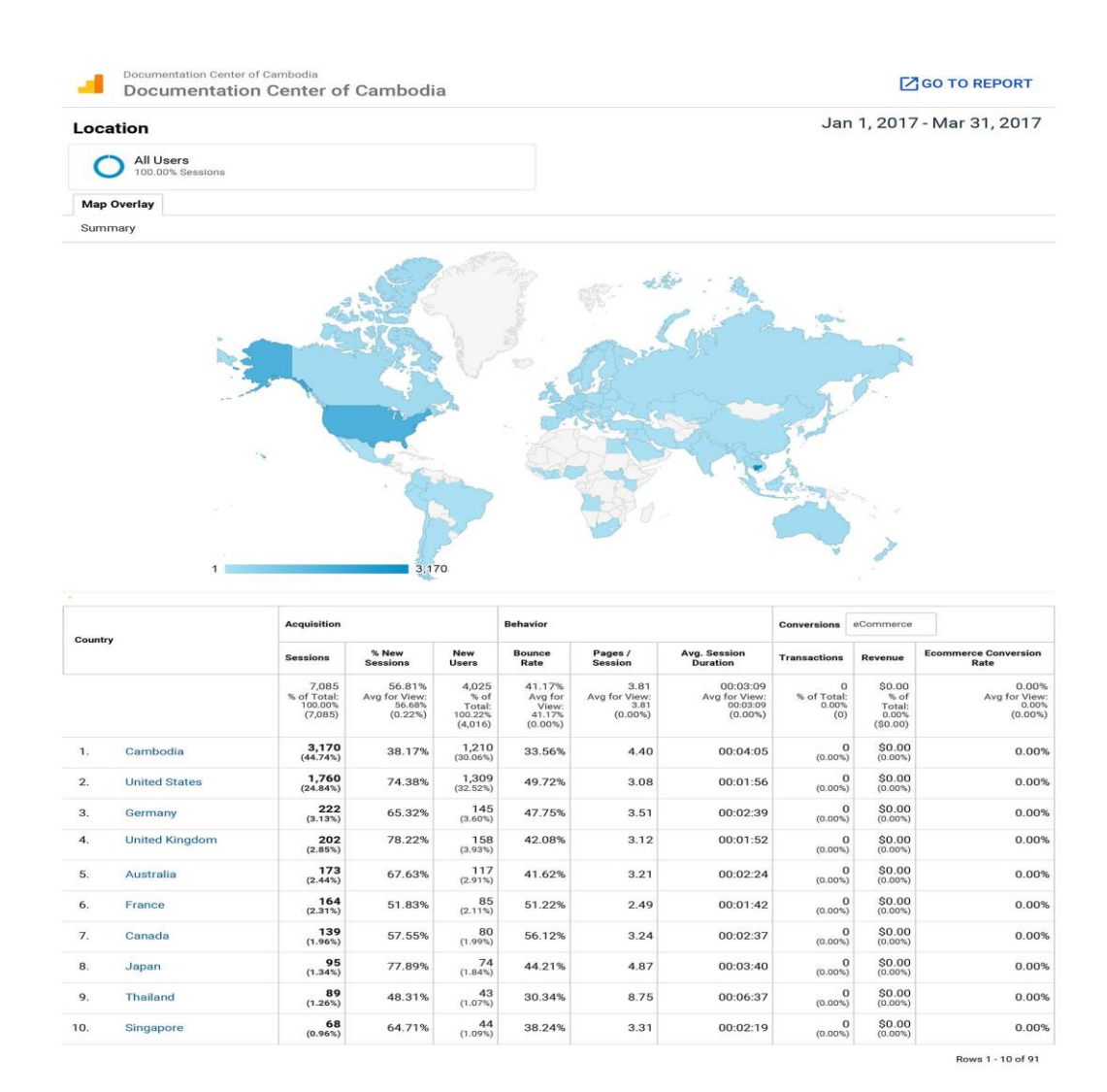
A6. Promoting Accountability (PA)

Since its interception in 2000, the PA program has played an important role in justice process at KRT. It has enriched the KRT and public's awareness of historical facts of the Khmer Rouge regime as well as facilitated family members' search for information about loved ones lost during the KR regime. The PA program is always committed to finding new sources of potential evidence, collecting additional documents, and securing victim and KR cadre testimonials in relation to the Khmer Rouge period. The PA program is committed to building up DC-Cam's archives through the collection of new records, oral history, and materials. It is also committed to increasing the public's access to these materials through cataloguing, copying, and digitalization.