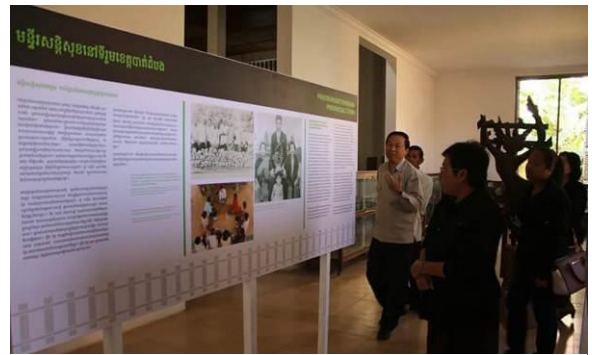
The Minister of Ministry of Culture and Fine Arts visited Forced Transfer Exhibition.

This quarter the team revised a proposal for submission to UNOPS for an exhibition installation in 10 provincial museums, including Kampot, Stung Treng, Mondul Kiri, Preah Vihear, Takeo (Angkor Borei), Kampong Chhnang, Pursat, Pailin, Kandal and Kampong Speu. The team resubmitted the proposal to UNOPS to address a change in requirements. While waiting for UNOPS' response to the application, the team moved forward with plans for the exhibit. They