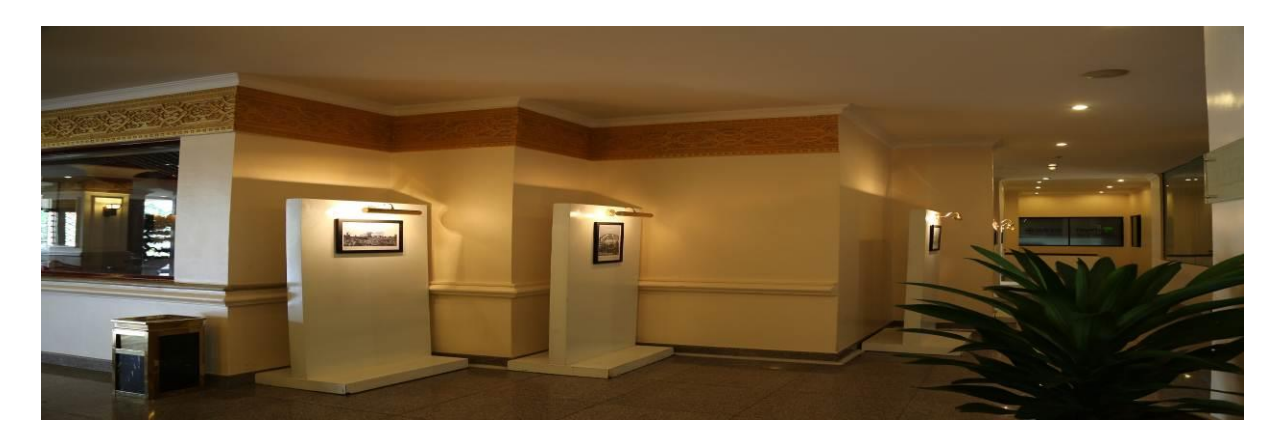
Issue 193, http://d.dccam.org/Projects/Magazines/Magazines/Issue193.pdf

Read news at http://khmer.voanews.com/content/an-interview-with-nhean-socheat-on-photo-exhibition-revisit-phnom-penh-and-its-importance/3193533.html