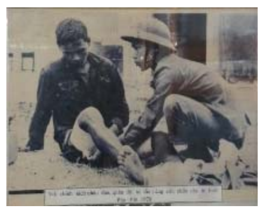
A Vietnamese soldier wounded in the war against the Khmer Rouge, on display at An Giang Museum