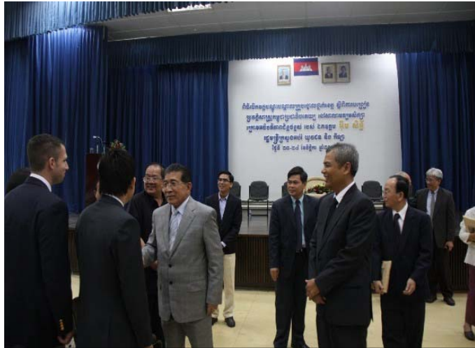
H.E. IM Sethy, Minister of Education, with the Genocide Education Project team

The Provincial Training workshop is the second step in a tripartite process to train teachers throughout Cambodia in the instruction of DK history. 48 National Trainers received a similar training last quarter. The National Trainers subsequently served as “core leaders” in the provincial level workshops and were responsible for disseminating history, modeling lessons, and facilitating small groups.