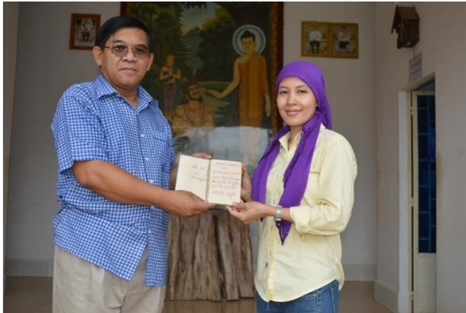
Diary under the KR regime given to DC-Cam in August 2014

photos. It is quite amazing how so many of our fans can relate to the experience and how many are willing to share their personal stories as well.” See this https://www.facebook.com/voakhmer/posts/10152490598128800