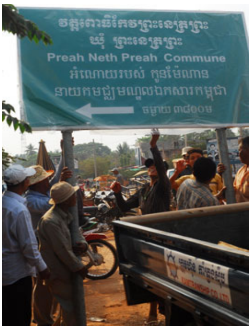
quarter, some of the villagers visited Phnom Penh on an ECCC/Tuol Sleng/Choeung Ek tour (see the Living Document section). Attendees at the groundbreaking included US embassy staff and the provincial Governor. A street sign was posted in March.