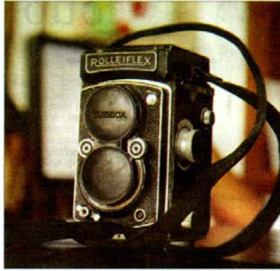
The Rolleiflex camera that was used to photograph victims of the Tuol Sleng detention centre displayed at the Documentation Center of Cambodia in Phnom Penh yesterday.

"This camera was kept by my father until 1996 when he had to travel to the US for heart surgery. I just kept it in a