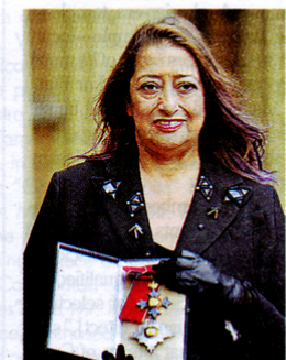
Architect Zaha Hadid