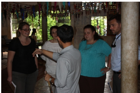
DRL Delegation in the field, 20 November 2013

On November 20 th , a PVF was held in Koas Kralah Commune, Koas Kralah District, Battambang Province. It has involved 60 students (30 female) from Koas Kralah High School and 45 villagers (25 female) and teachers. The forum turned its attention to the historical facts related to the forced transfer of the population called 'Easterners' or 'Blue Scarf People' which was a consequence of the deep distrust among the KR echelons. It also touched upon whether the brutal treatments and executions could