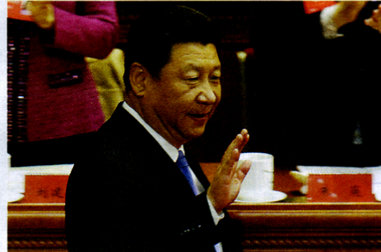
Chinese President Xi Jinping

Liu Meiling (not her real name, for fear of endangering her party position) is a smart, ambitious woman in her 30s who works for a foreign-Chinese joint venture in Wuhan, an ancient but dynamic