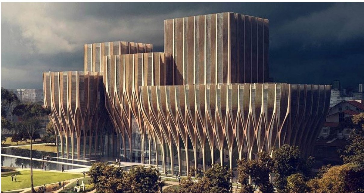
The Sleuk Rith Institute's design unveiled by Zaha Hadid and launched October 9, 2014, London, the United Kingdom. See WWW.CAMBODIASRI.ORG