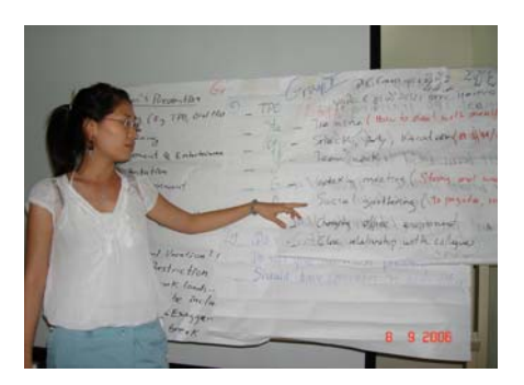
Group discussions and presentations at TPO Cambodia's training course

At the end of the year, the team worked on a long-term plan for the project (e.g., income generating activities, cooperating with other NGOs in addition to the identification and treatment of trauma victims). Its assessments revealed that it will not be possible to work directly with TPO Cambodia (this organization is overcommitted relative to its resources) or the Cambodian government clinics (because of their shortage of funds), although in the future, the VOT Project will continue to refer people to them. Instead, the project will focus on local training and working with international NGOs to help improve the project's services. We have made several