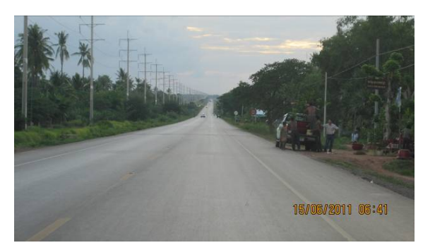
Road # 6A

The district of Preah Netr Preah is located between Banteay Meanchey provincial town and Kralanh district in Siem Reap province, along National Road #6A. Preah Netr Preah is one of eight districts in the Banteay Meanchey province. The district is approximately 400 kilometers from Phnom Penh by National Road #5 and down Road #6A from the Banteay Meanchey provincial town.