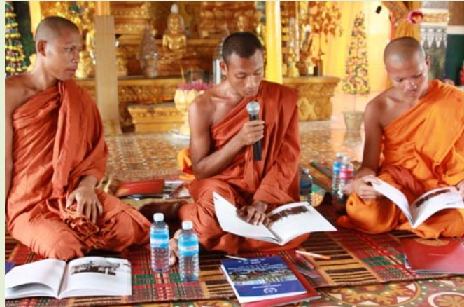
Monks in public education forum in Kampong Chhnang