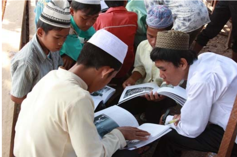
Cham Youths Discussing the Textbook in Group, Kratie forum