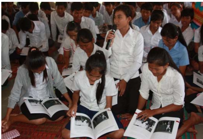
Students in public education forum in Prey Veng Province