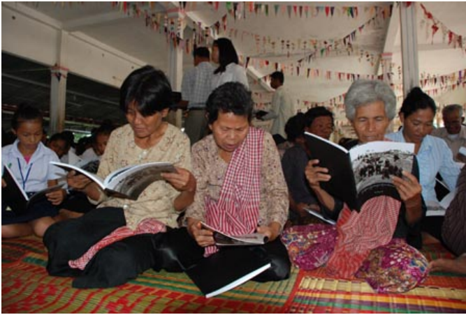
Villagers in public education forum in Takeo Province

The KR used the word “Democratic Kampuchea” because they did not want to follow any model of the previous regimes. Cambodia had gone through monarchy and republic. Moreover, the word “democratic” means the power is from the people, so they used this word to cheat the people in order to hold power.