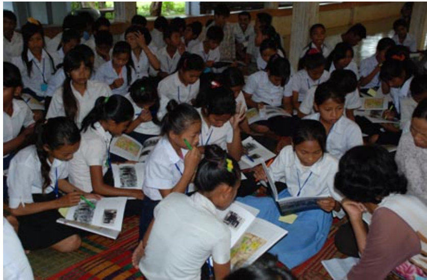
Students reading and discussing DK history textbook, Takeo