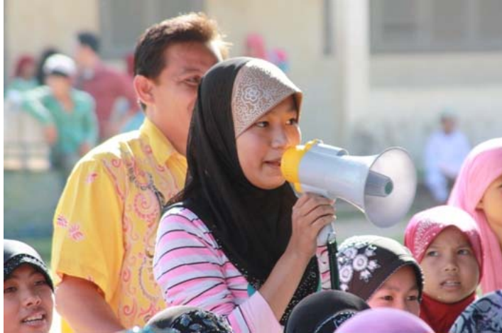
A Female Cham Youth Answering the Question, Kratie

Group 3: This group summarized that Prince Sihanouk resigned from the position as Head of State on March 11, 1976. The communist party met to discuss about the Prince's request. They agreed to his request but did not allow him to go outside the country. The monarchy that existed in Cambodia for nearly 2000 years came to an end. In April 1976, the People's Representative Assembly of the KR held the only