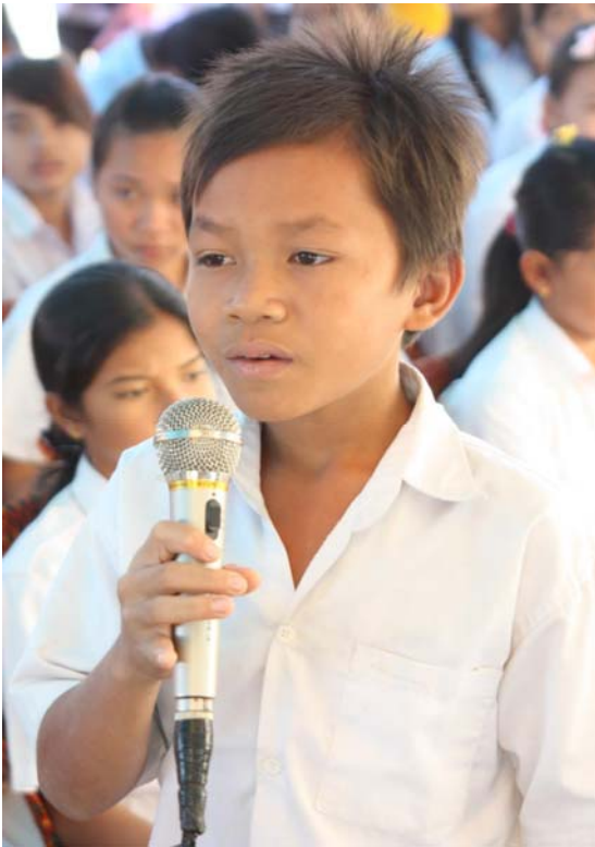
A young student in Koh Kong asking questions

Answers: The KR wanted to create a society of equality with no poor, no rich, no exploiters