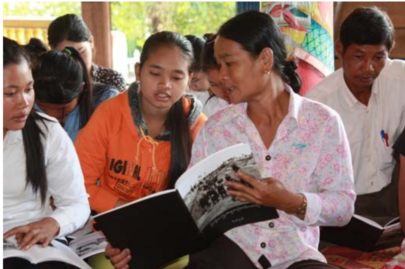
A Villager discussing lesson in the textbook with the students, Takeo