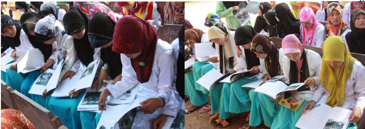
Cham Youths Reading A History of Democratic Kampuchea (1975-1979), Kratie

The opening ceremony started with welcoming remarks and an introduction by a project's team member. The team member introduces the program of the day which starts with a brief description of DC-Cam's work and the objectives of the public education forum. It is followed by a short remark of the commune chief or representative. The team member mentions the collaboration between DC-Cam and the Ministry of Education in conducting