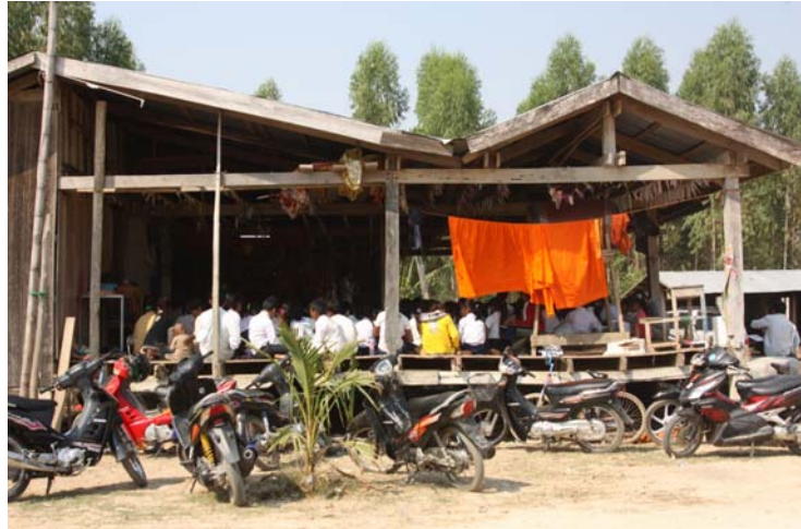
Participants in the public education forum in Banteay Meanchey

After the opening remark, the team members distribute pre-forum survey to all participants who spend between fifteen to twenty minutes filling in the survey. The purpose of the pre-forum survey is to examine participants' prior interests and attitudes toward learning DK history. At the end of the forum participants fill in the post-forum