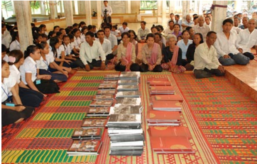
A Public Education Forum in Kirivong District, Takeo Province

First Report for the Asia Foundation, September 2010-March 2011