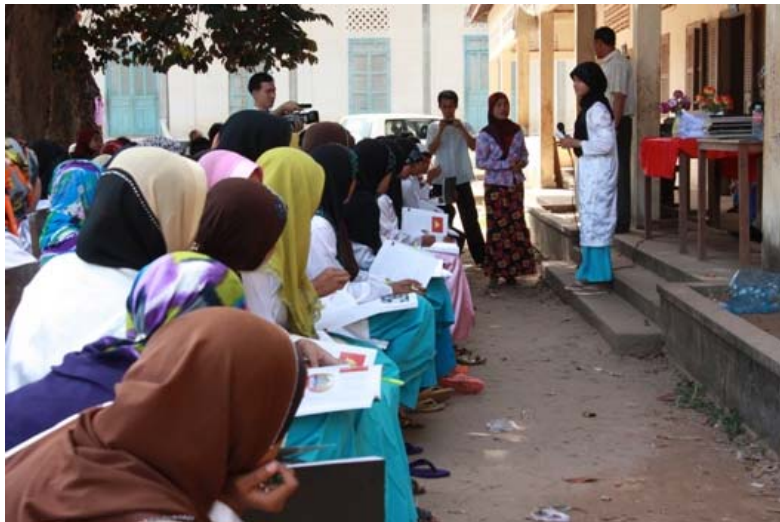
Discussion on the Chapter 4 of the Textbook, Kratie forum

cooperatives, communes, district and in many other management roles throughout the country. These swift changes led to a number of killings and deaths. In addition, in order to make Cambodia to be a fully independent nation, all Cambodians had to have strong stand and will. The KR leadership believed that Cambodian people nationwide had only energy but no revolutionary stand without which the country could not be independent. Therefore, they wanted to strengthen people's stand by forcing all people to do hard labor, to eat less and to attend daily life meeting to criticize oneself and to put oneself for others to criticize. The KR believed that doing so the people would have strong revolutionary stand and move the country forward toward the most modern socialist country in the world. Those who could not bear with this strict policy would be considered as bad elements and would be smashed. These are some reasons of almost two million deaths during DK period.