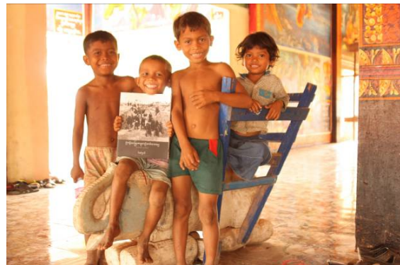
Children in public education forum in Kampong Thom Province