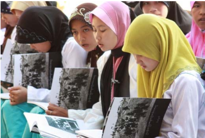
Cham Youths Reading A History of Democratic Kampuchea, Kratie

Participants were given 15 minutes to read and take notes on important events in the reading. After reading, each group chose their representatives to summarize their respective points.