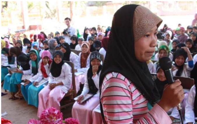
A Female Cham Youth Answering the Question, Kratie

Group 6: One male youth representing group six explained to all participants the biography of Khieu Samphan, "Khieu Samphan was an educated person and who became a communist around 1967."